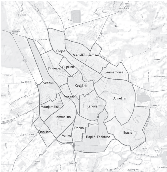
Fig. 1. Tartu, Estonia and its 16 official neighbourhoods [Figure: D. B. Hess, E. Iacobucci, A. Väiko].

about neighbourhoods and districts because there was little or no control in place of residence in state-provided housing. In addition, it was forbidden to print or distribute maps in Soviet cities for fear of maps falling into enemy hands [11]; consequently, residents of Soviet cities were usually familiar with their immediate neighbourhood and the city centre but had little knowledge about other neighbourhoods.